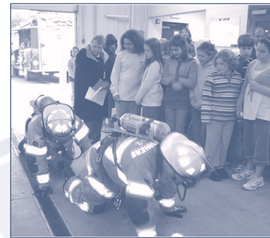
Firefighters demonstrate how they search for people trapped in a house