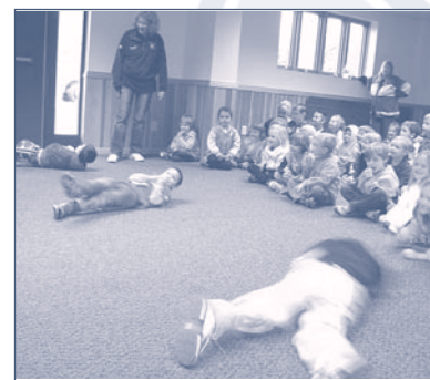
Kids practice Stop! Drop! And Roll!